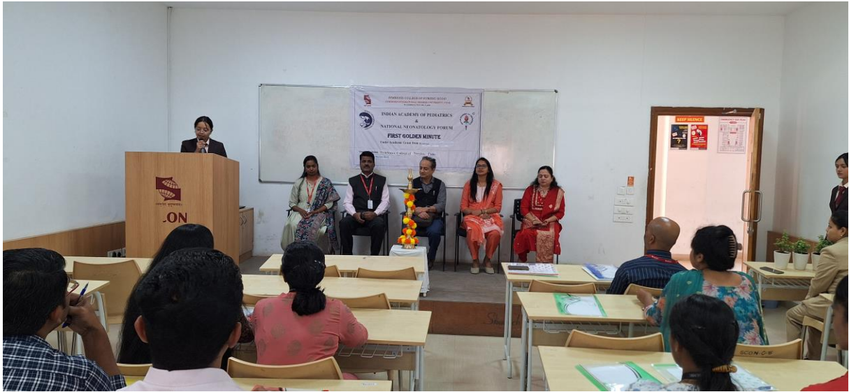
Introduction Of Basic Newborn Resuscitation Program