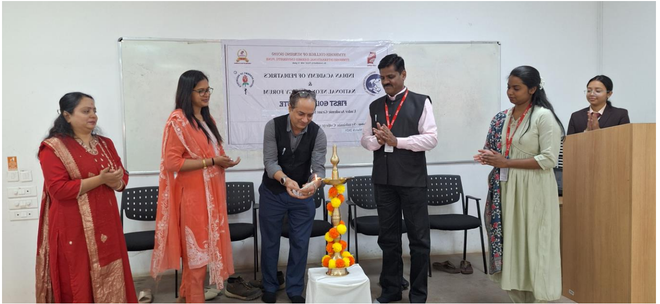
Program started with lamp lighting ceremony